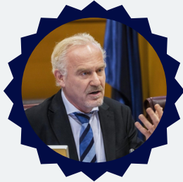
Josep Figueras European Observatory on Health Systems and Policies